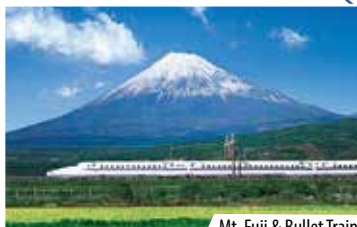
Mt. Fuji & Bullet Train