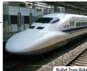
Bullet Train Ride