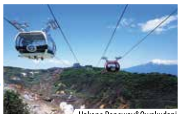
Hakone Ropeway & Owakudani